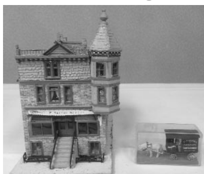
Best of Show: Ed Varick's HO scale Grandpa's Bakery Shop structure

The following are the results for the Popular Vote Contest held on January 15, 2017.