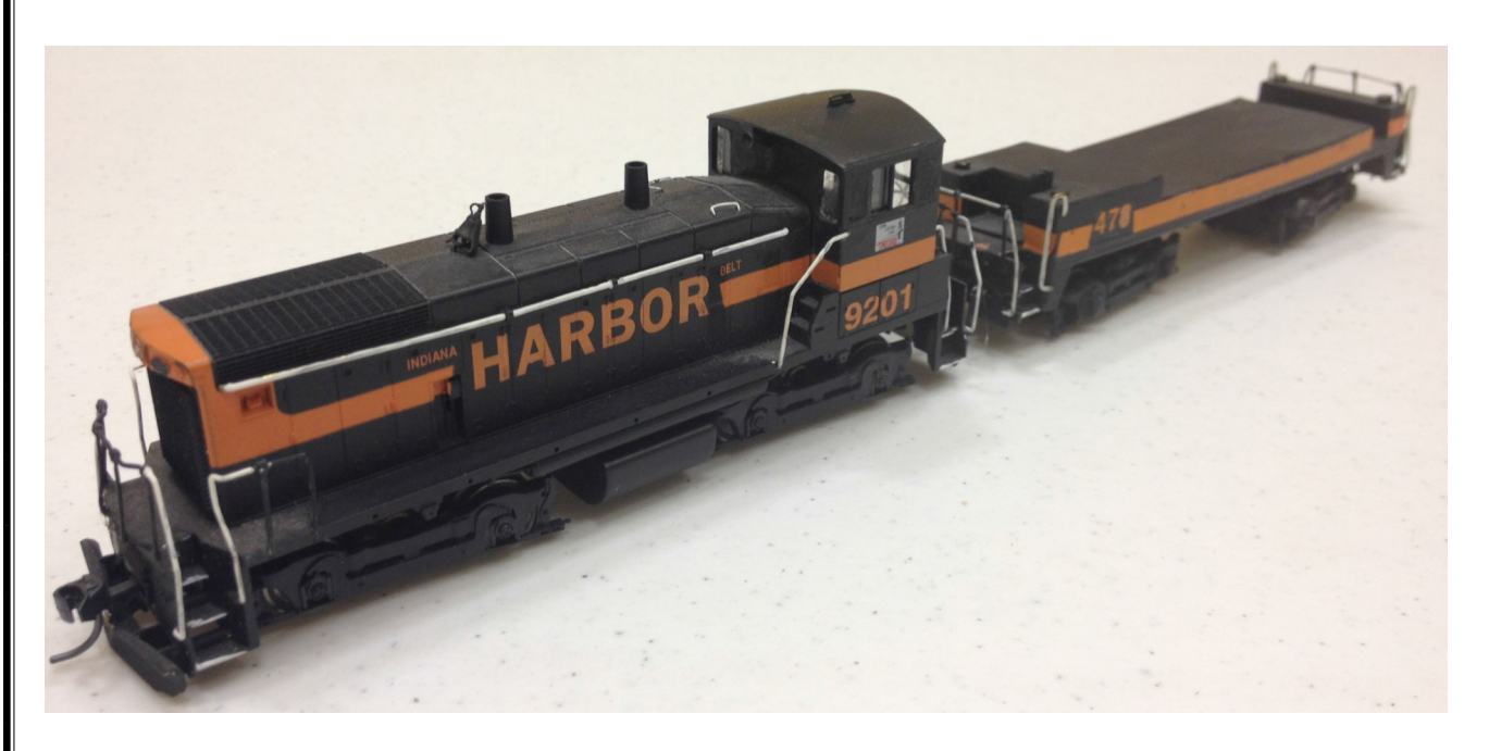
BEST OF SHOW / Mike Slater (IHB Slug Set) Motive Power – Diesel 1st Place / Mike Slater (IHB Slug Set)