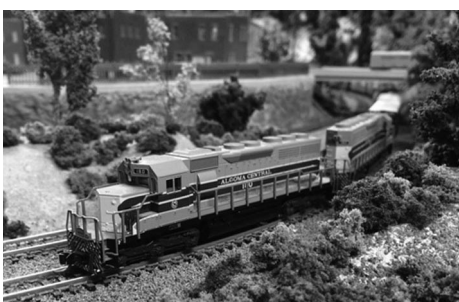
Some pictures of Steve Miazga's N scale layout from the September 20 meet.