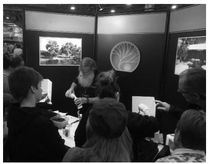
Best of Show - Display

And finally, here are the rest of the award winners from Trainfest 2015 – the displays.