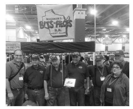
Bits 'n Pieces last time at Trainfest

In my opinion Trainfest 2017 was a great success. During the show feedback from all exhibitors was positive and vendor sales were good. We had good participation in the Make & Take and Jr. Engineer Programs and the Historical Display on the SOO Line was well received. Attendance was up from 2016. Here are the numbers for 2017