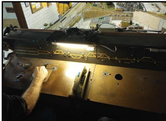
The layout is controlled with B17 and B25 airplane components from WWII