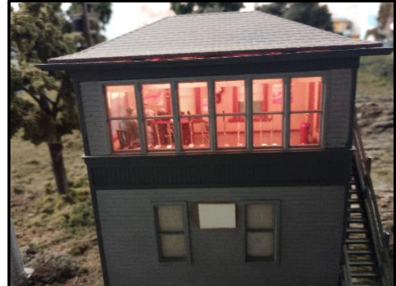
Notice the detailed interior of this Interlocking tower

The club's 30 x 54-foot layout is an O scale 2 rail that employs a block system and WWII technology that is used to control the layout as shown in the photo below. The club is the oldest train club in the state of Wisconsin and the second oldest O scale club in the United States.