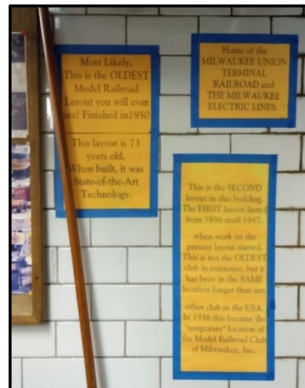
The history of the club